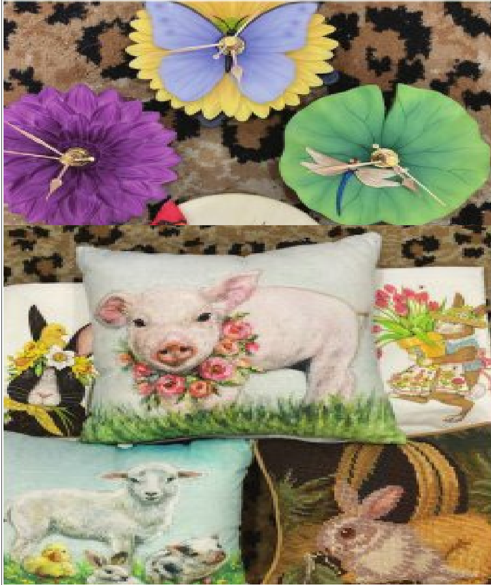
Patricia's Presents has gifts and accessories for your holiday gift giving. They are located at 164 Greenwood Avenue in Bethel.